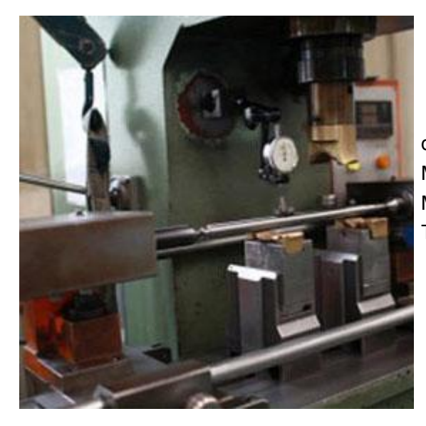
detection Microhardness testing Metallographic analysis Tensile/torsion test

finishing Basic structure dimensions of constant temperature finishing products