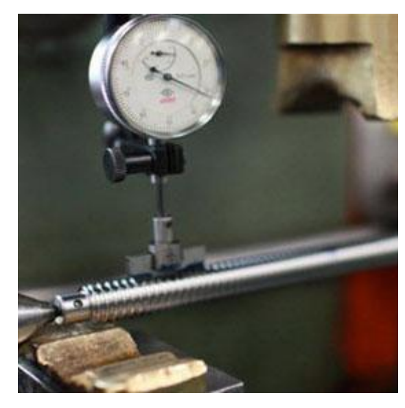
The re-inspection 7 screw installation parts test screw stiffness test Preloading test Precision test of each part

Packing/warehousing 1.5m drop resistant packaging